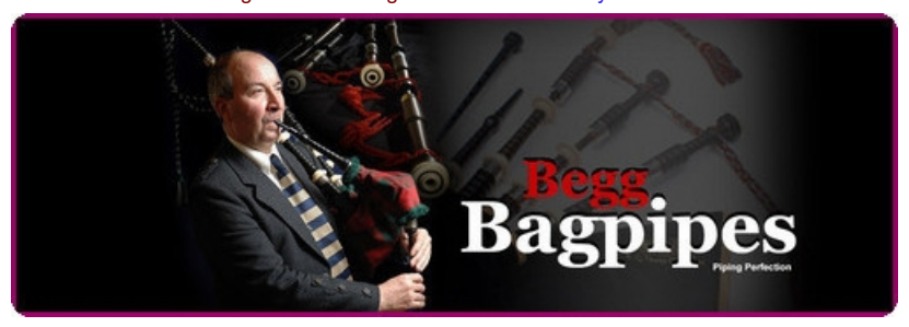
click on the banner for our home page

Having trouble reading this email? View it in your browser.